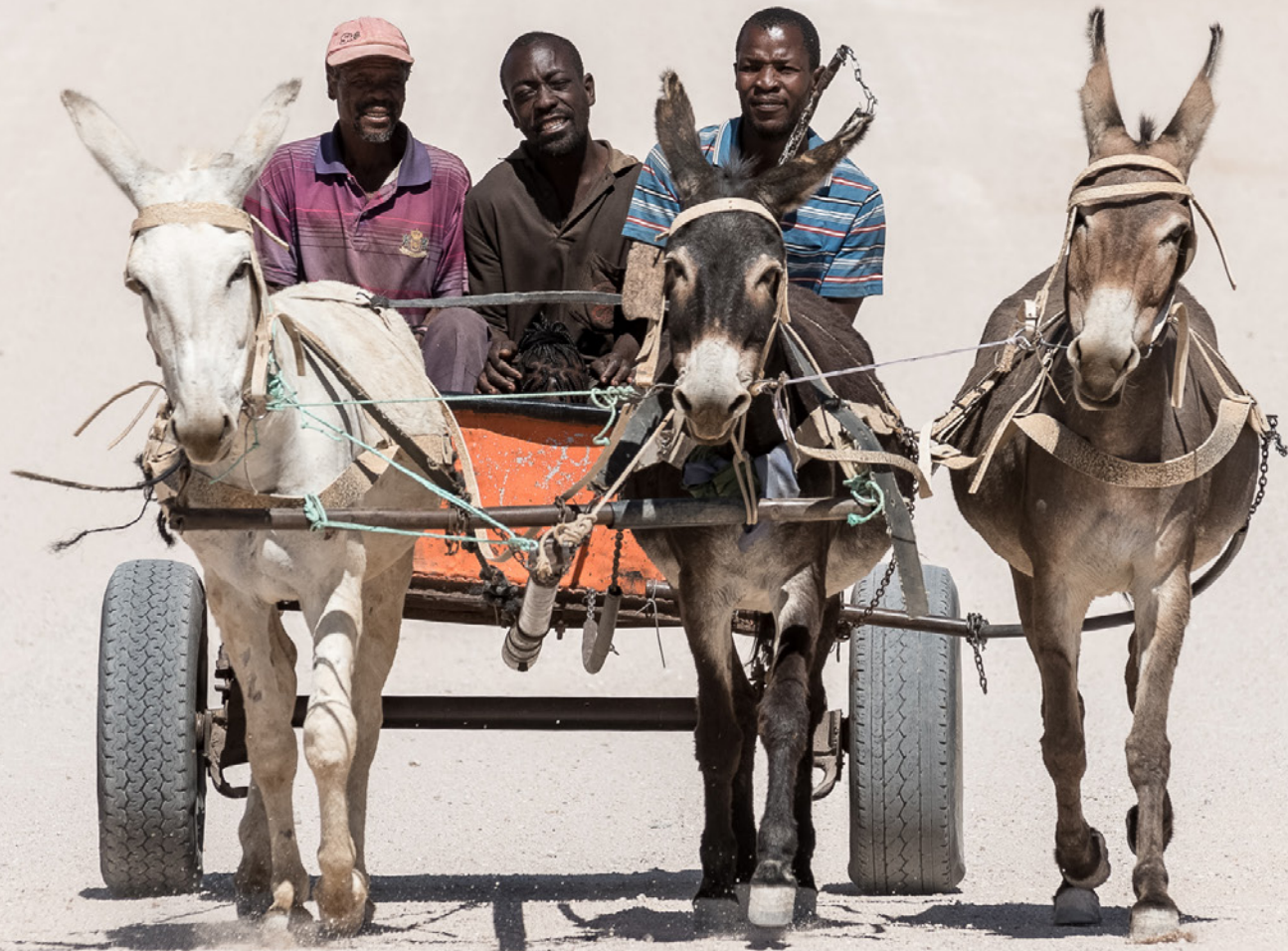
A group of men traveling by donkeycart near the turnoff from Spitzkoppe on the road from Henties Bay