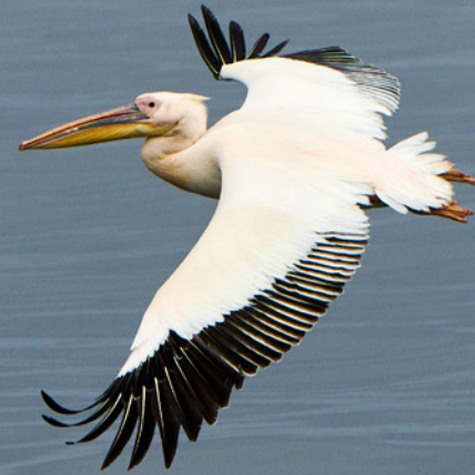
A Pink-backed Pelican in flight over the cold water of Sandwich Harbour near Walvis Bay.

Finally we make our way back to Windhoek where photographers can opt to fly out immediately or organize to stay near to the airport for a more leisurely departure the following day.